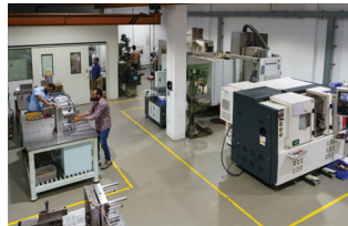
In-house Mould Making Setup