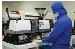
Micro Moulding Production Line