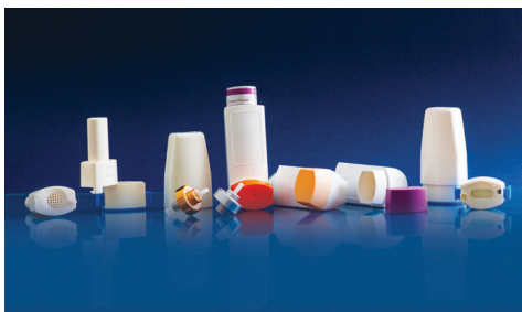
Inhalation Delivery Devices - PMDI, DPI