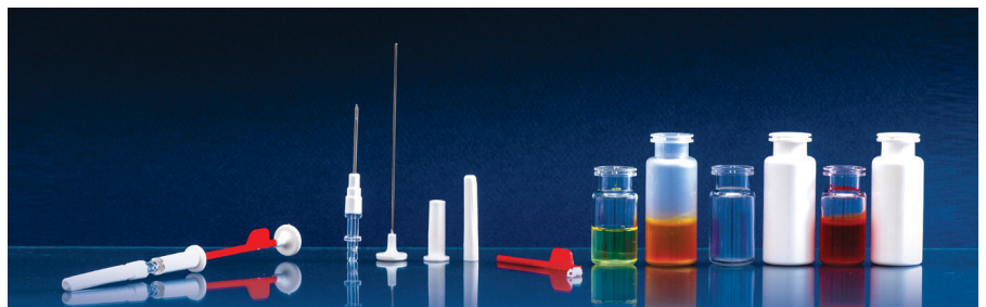
Parenteral Delivery Devices - Implant Device, COC/COP Vials