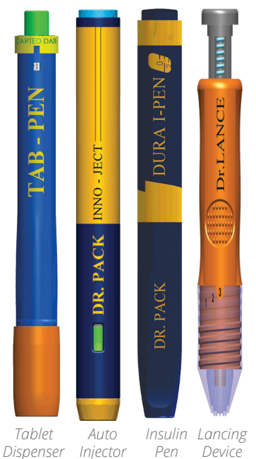
Tablet Dispenser Auto Injector Insulin Pen Lancing Device