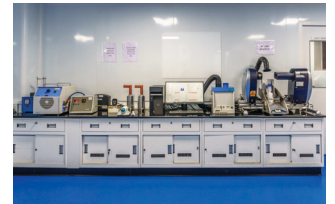
Device Validation Lab

In-house Design & development team: Our Development Process starts with understanding of your specific requirements. Our dedicated team of product designers and technical experts work on giving you innovative options with scientific approach. 3 D modeling, 3 D printing, SLA models submission of the development product eliminates costly mistakes.