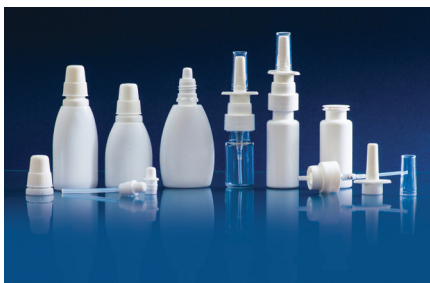
Nasal Delivery - Pumps, Squeeze Spray System