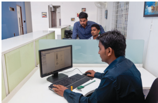
Design & Development Team