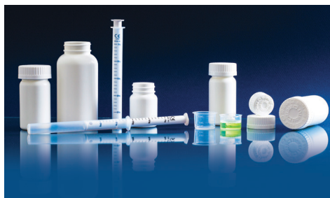
Oral Delivery - CRC, Dosing Syringe, Container