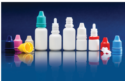
Ophthalmic - with Flow Control Nozzle