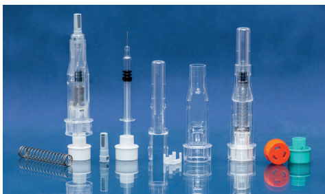
True Safe - Needle Safe Device